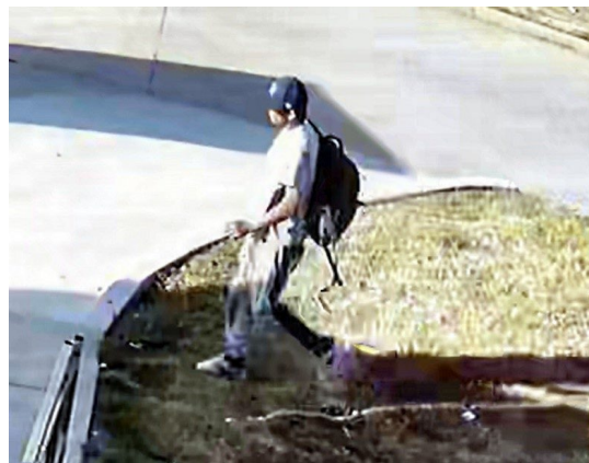
Unknown 2 nd Suspect Image 2