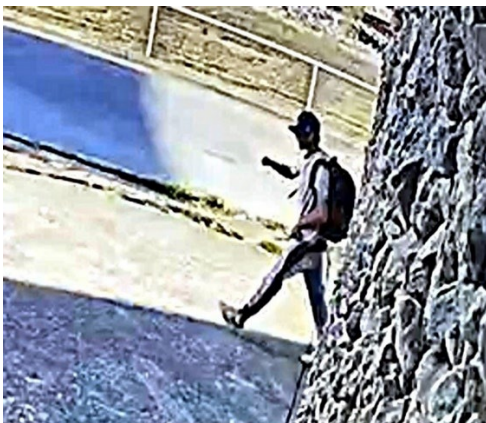
Unknown 2 nd Suspect Image 1

Garland Detectives are also asking for the public's assistance in identifying a second unknown subject seen below. This subject was seen leaving the area of 11438 LBJ Freeway, just inside of the Dallas city limits, on the day of the offense.